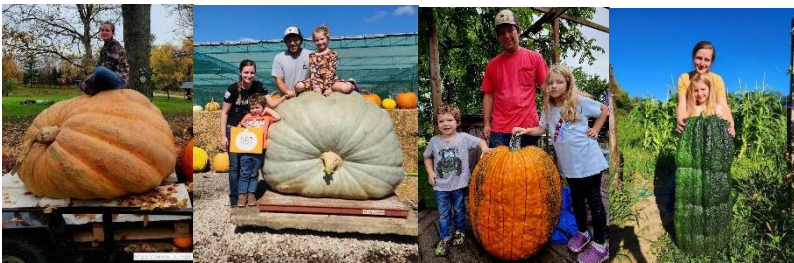
1902.5 Ruthruff 1166 Ruthruff 147 Ruthruff 80.5 Ruthruff

(1686.5 Stelts x 1885.5 Werner) (2030 Tobeck x Sib) (151 Young x 268 Baggs) (235.9 Baggs x Sib)