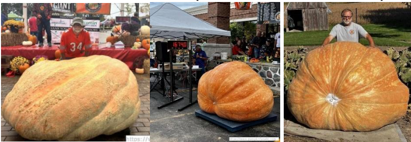
1829 Ford 1674 Ford 2177 Ford

1829 Ford 23 (2365 Wolf x 1935 Ford) 1674 Ford 23 (1935 Ford x 2110 Platte) 2177 Ford 23 (1885.5 Werner x 1935 Ford)