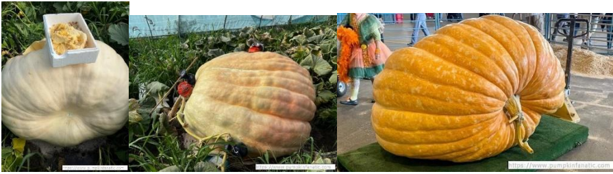
805 Mendi 2009.5 Mendi 2147 Marshall

805 Mendi '22 (1885.5 Werner x 2183.7 Mendi) 150 sq ft plant 2009.5 Mendi '22 (2183.7 Mendi x Sib) 2147 Marshall '22 (2183 Mendi x 2365 Wolf) 10% heavy Alaska State Record 1819 Marshall '22 (2365 Wolf x 2183 Mendi) 5% heavy 2023.5 Marshall '23 (2147 Marshall x 1885.5 Werner) 8% Heavy 85 DAP 1878.5 Marshall '23 (1885.5 Werner x 2147 Marshall) 6% Heavy 87 DAP 2051 Marshall '19 (2416 Haist x 2469 Daletas) Alaskan State Record!